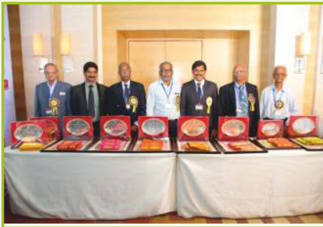
Display of Awards