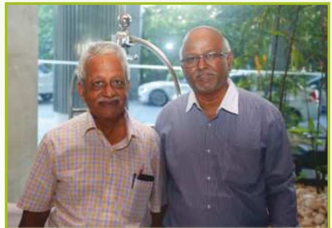
Wheel & Axle of the back-office