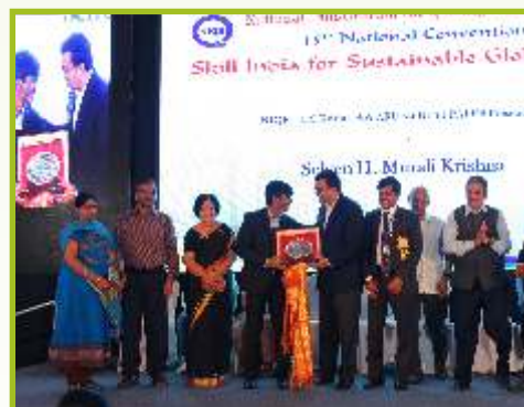
His parents and Principal join in the felicitation