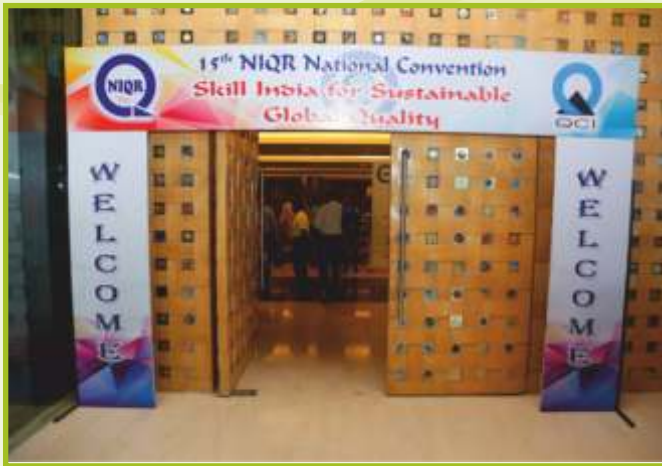
Welcome Display at the entrance