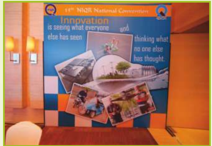
Innovative and Informative Displays